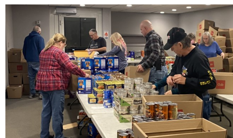
Lodge members providing non perishable food packs and hot holiday dinner to low income veterans