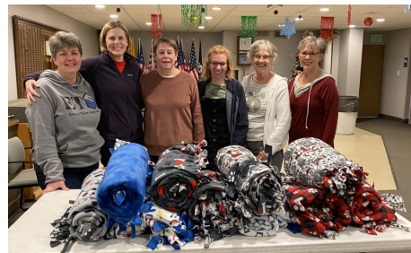
Lodge members making tie blankets for My Very Own Bed (a Welcome Home Veterans partner)