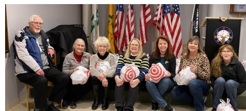
Lodge members creating holiday food packs for kids in need to address food insecurity over the holiday break from school